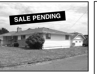
3 BR, 2 BA HOME w/2 fireplaces & full basement. One car attached garage + 2 car detached garage, RV parking, too!.....$238,000

QUALITY THROUGHOUT this beautiful 3 bedroom, 2.5 bath home w/open floor plan and nice deck. This is a MUST SEE!.....$239,000