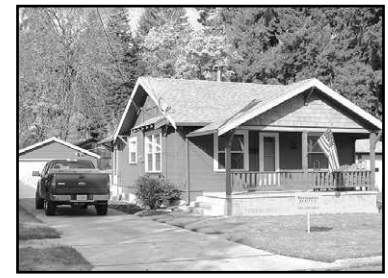
CHARMING 3 BEDROOM, one bath home, move-in-ready. Fenced yard, detached two car garage. Great location on B Street.....$164,900