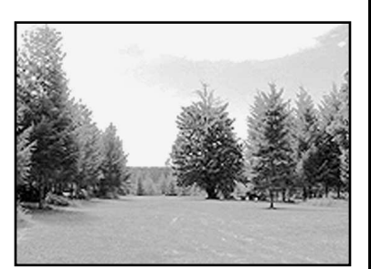
YOU'LL LOVE THE PRIVACY on 10+ acres in 2 tax lots. Well in, septic approved w/conditional use permit. Rural living yet close to town.....$279,999