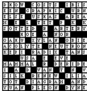
Answer to September 7 puzzle