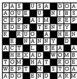
Answer to May 18 puzzle

J is for June & Jungle. Here are two jungle creatures to color.