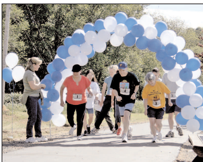
The Vernonia Cares 3M Fun Run/Walk on Saturday, May 20, didn't draw a huge crowd, but was enjoyed by those who did participate. Pictured above is the start of the three mile run around Vernonia Lake. Look for the Vernonia Cares 10K Bear Creek Run on August 19, 2006.

Applications are available at the District office at 475 Bridge St., Vernonia.