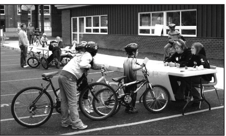
Although the weather wasn't cooperating on April 29, being wet and cool, the Bike Rodeo drew around 100 children and adults and was deemed a success by the police department.

For more information, contact PCC Community Education at 503-731-6619.