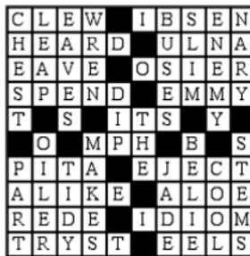
Answer to December 1 puzzle