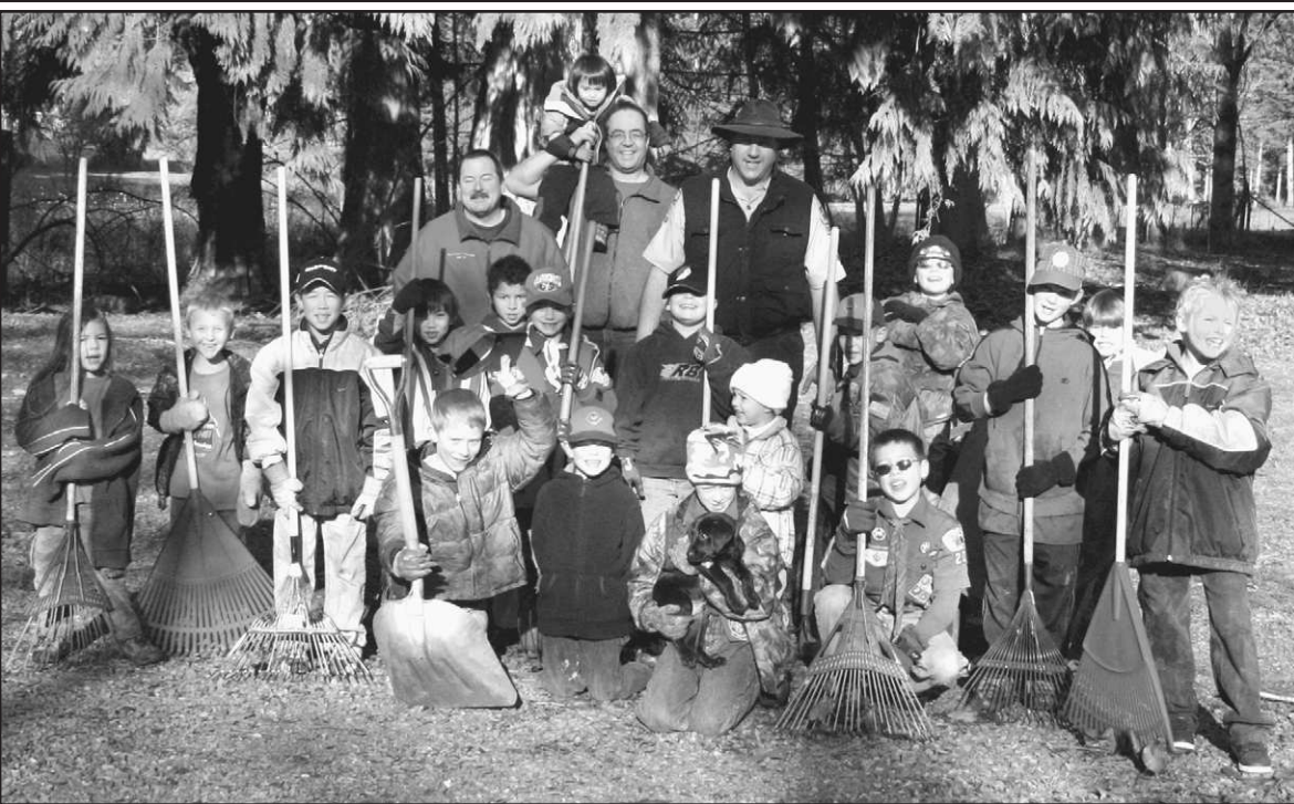
Cub Scout Pack 201 came out on a recent Saturday morning to clean up Hawkins Park. They raked and raked and cleaned and cleaned until the park looked great.