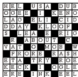
Answer to October 6 puzzle