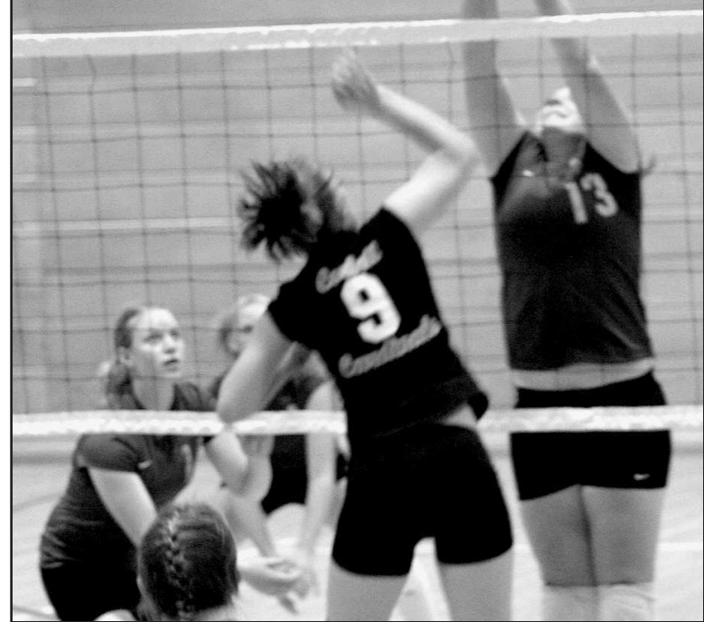
Left, below; action at the October 7 game against Portland Christian. Below, a play from the volleyball game on October 11 (Pack the Gym Night) against Corbett.