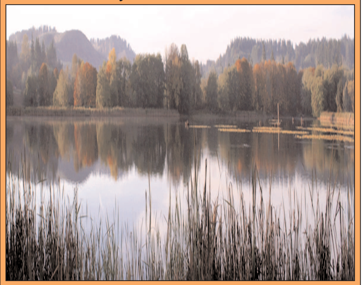
Autumn colors highlight foliage at Vernonia Lake.