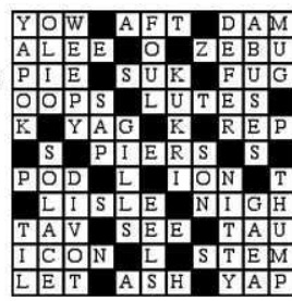
Answer to September 1 puzzle

Count the fish? How many did you find? It might help to color them first.