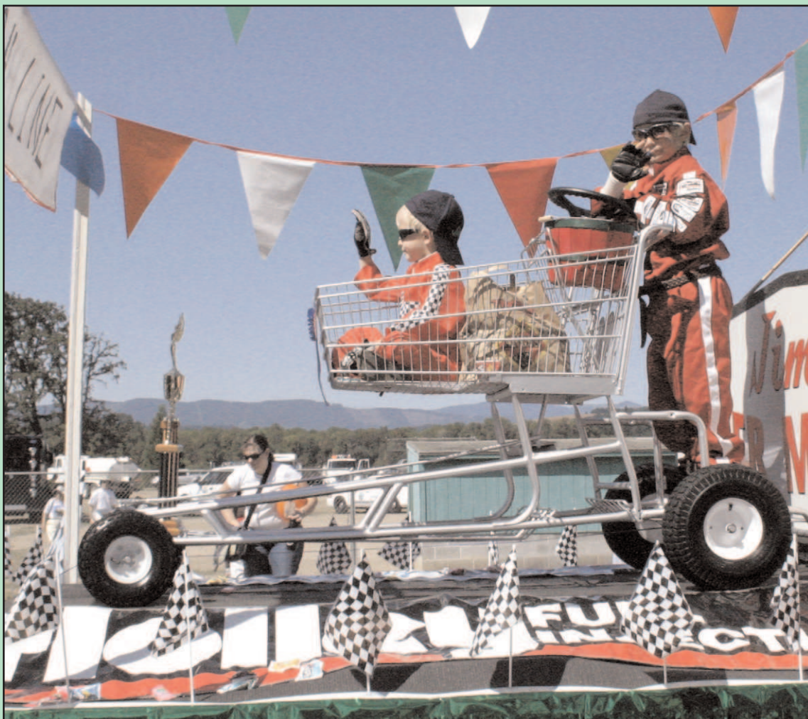
If others can pull with trucks, tractors and combines at the Banks Barbecue, why not a grocery cart? More photos on pages 12, 13 and 14.