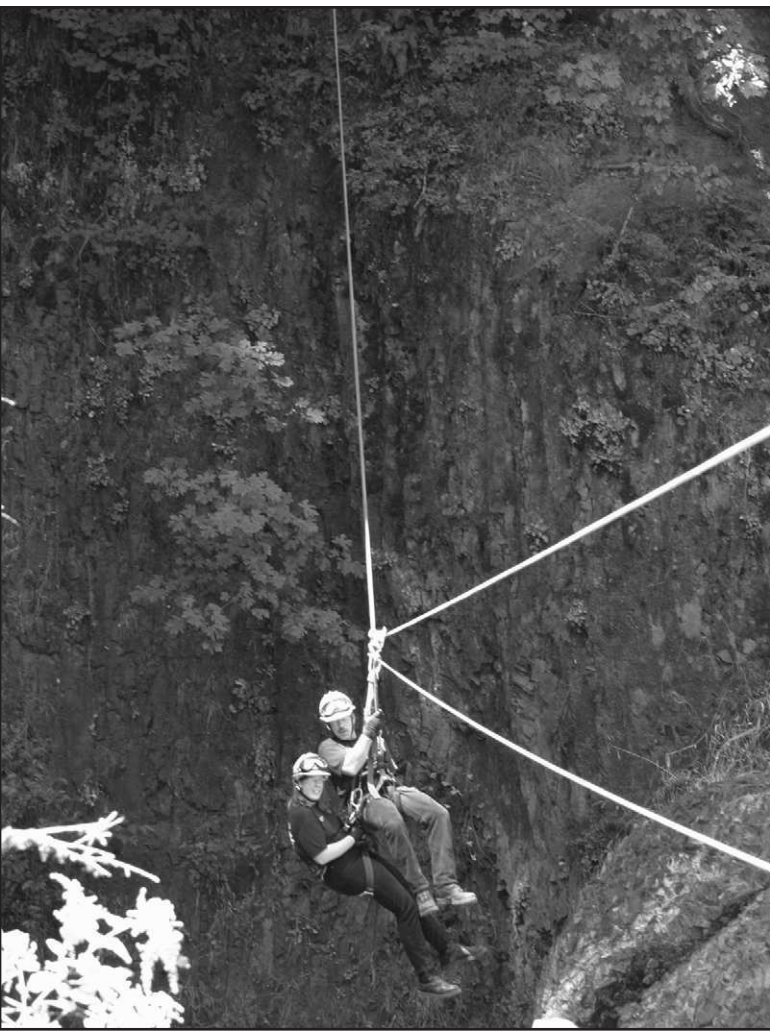
The Scappoose Rural Fire District holds rope rescue training each year. This year, they opened the training up to other Columbia County agencies and personnel from Columbia River Fire and Rescue joined them. The training was held July 25-29 at four locations; Scappoose Sand & Gravel, Bonnie Falls (where the above "rescuer" and "victim" are shown dangling above the falls on July 29), at the fire station, and at Boise Paper Solutions.