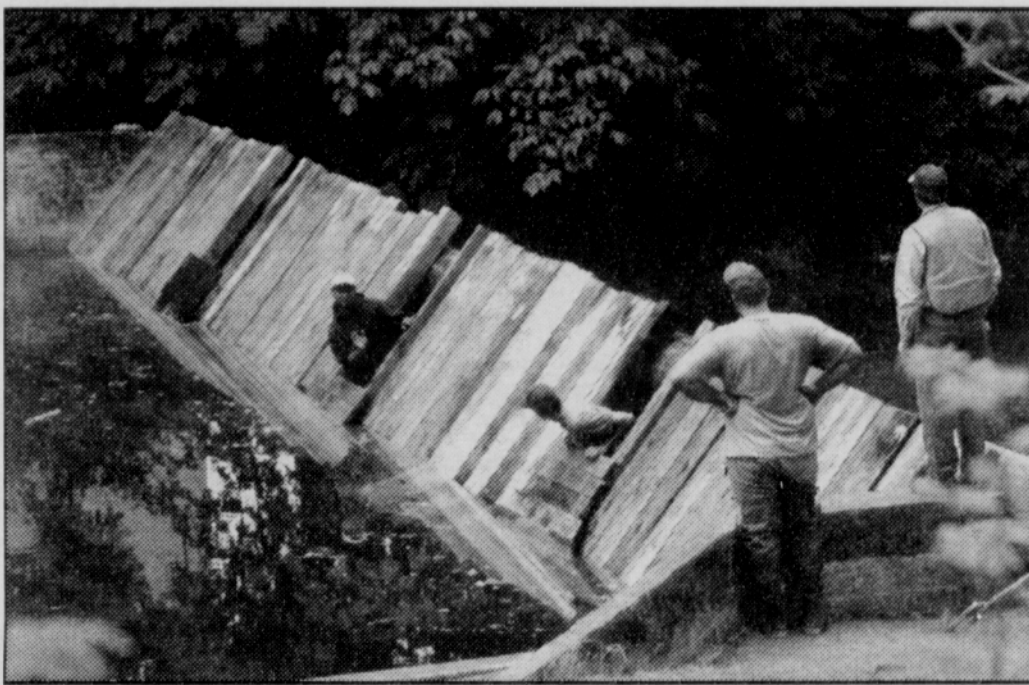
The annual raising of the dam, to create Dewey Pool for the summer, took place last week thanks to the Public Works employees shown above caught in the act.

The Vernonia Pioneer Museum is open Friday, Saturday and Sunday from 1:00 to 4:00 p.m. If you have ideas to share, want to have the museum open at a special time, or need information, leave a message at 503-429-3713 or by e-mail <VPMA@agalis.net>.