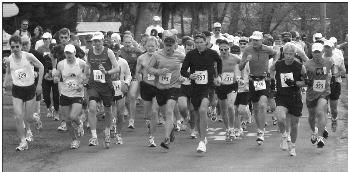
Above, the start of the Oregon Road Runners Club 1/2 Marathon on April 9 from Anderson Park to Buxton, 13.1 miles.

The likelihood of being infected continues to be very low. Most mosquitoes don't have the virus. Even if a mosquito is infected, less than 1 percent of people who get infected get severely ill. The best defense continues to be avoiding mosquito bites as much as possible.