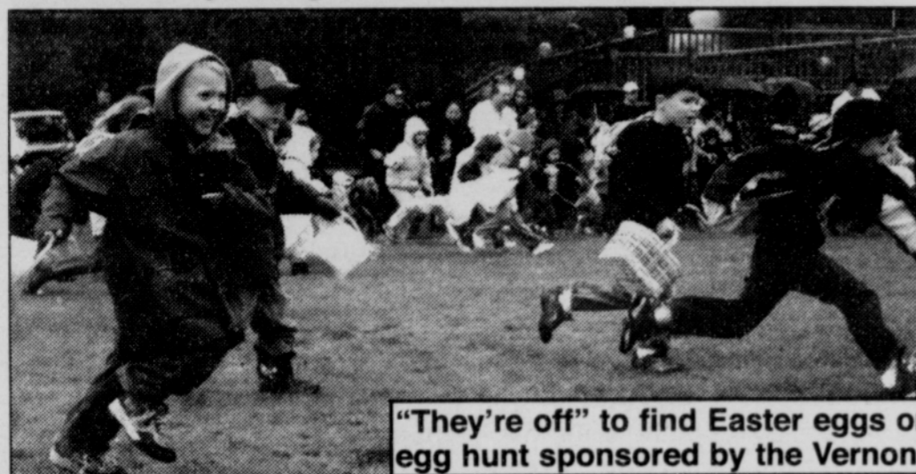
"They're off" to find Easter eggs on March 26 at the annual Easter egg hunt sponsored by the Vernonia Chamber of Commerce.