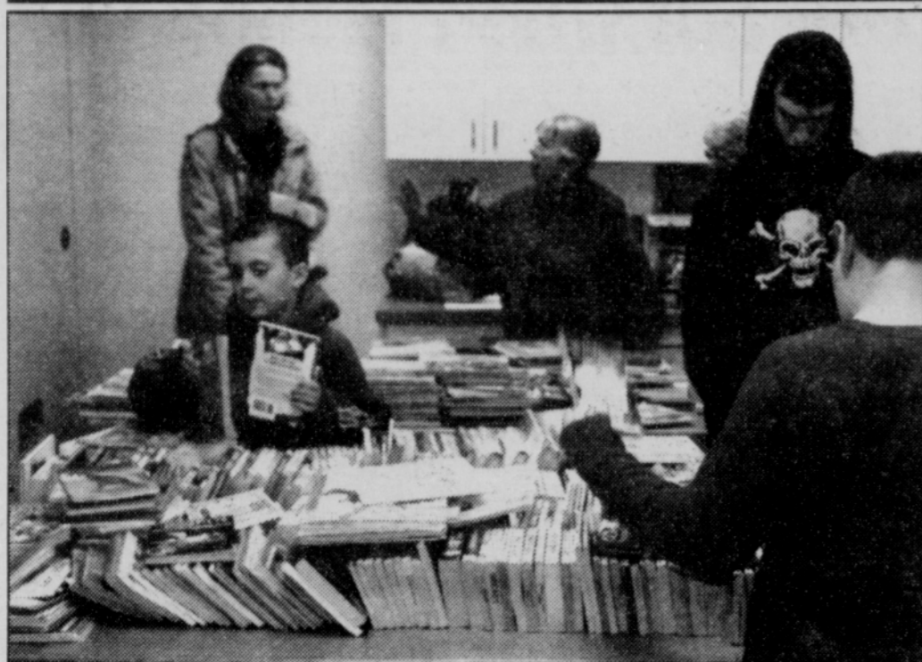
Shoppers at the annual Vernonia Library Book Sale on March 19 came away with great deals, as all books were $.25 each.