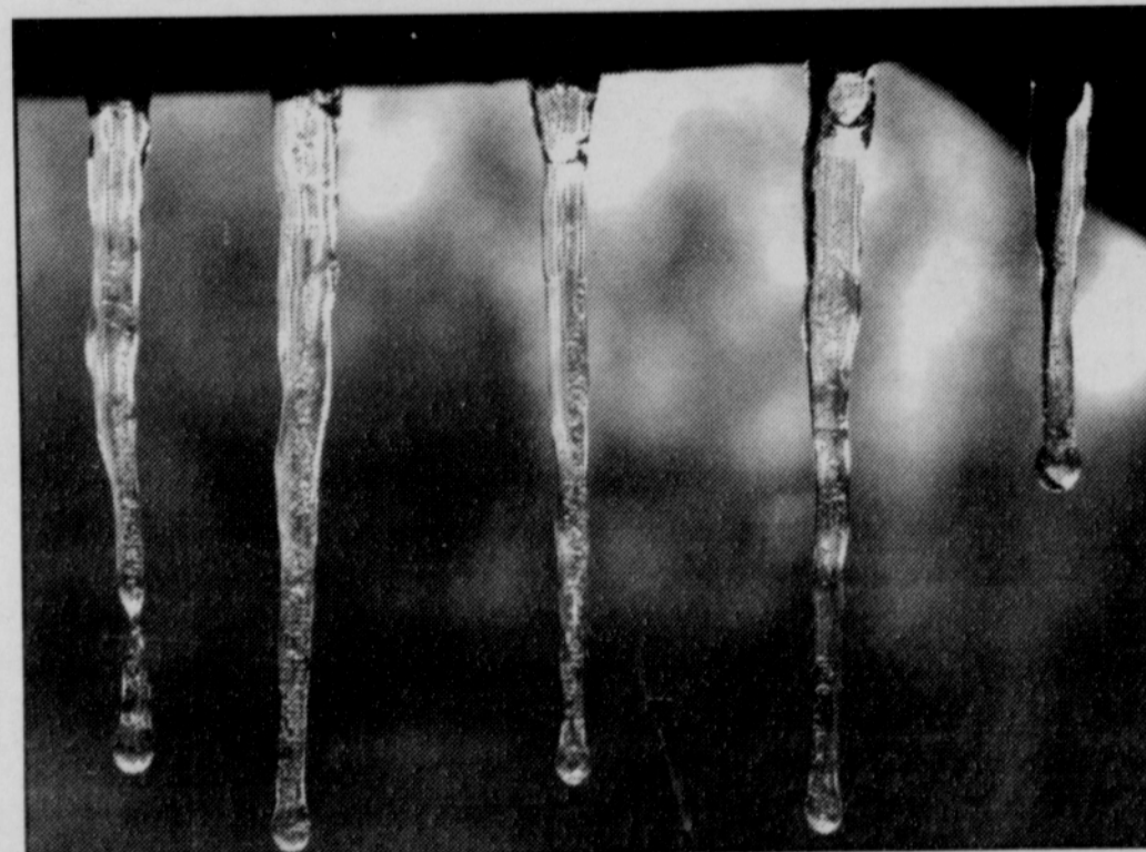
Icicles hang from the Anderson Park bridge during last week's ice storm.