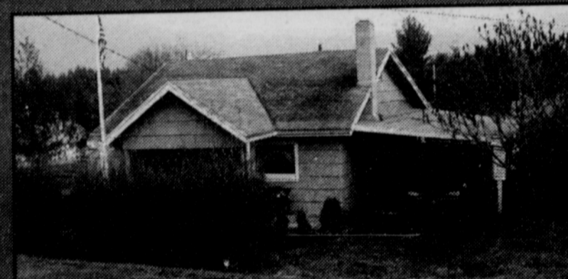
924 2nd Avenue, Vernonia...$134,950

3BD/1.5BA bungalow remodel in 2001. New kitchen w/maple cabinets, dishwasher, wainscoting, desk, new floor, dining nook. Lovely living area w/woodstove & cedar wall accents. Finished basement w/2BD & bath. Second buildable lot included in this fenced parcel. Pool, toolsheds, fruit trees & more! Don't judge this book by its cover! It is cute!