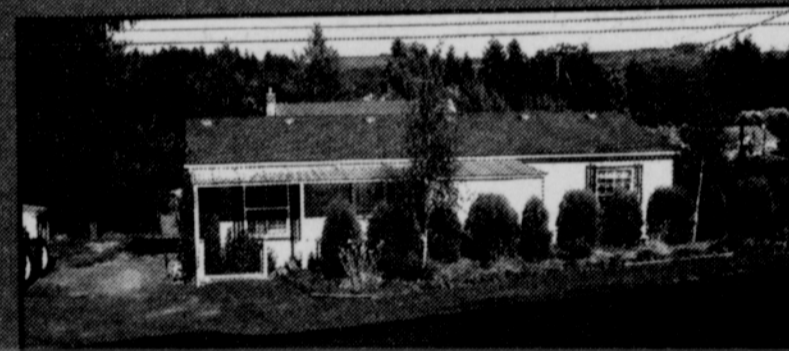
822 First Avenue, Vernonia...$114,500

Awesome 3068 sq. ft. three-story complex - prior use Christopher Burkett's studio! Excellent condition with 4 skylights, 2 gas furnaces, upgraded carpeting, security system, storage, loft, bath & kitchen. Zoning allows duplex conversion - check w/city! Excellent for two family needs w/modification!