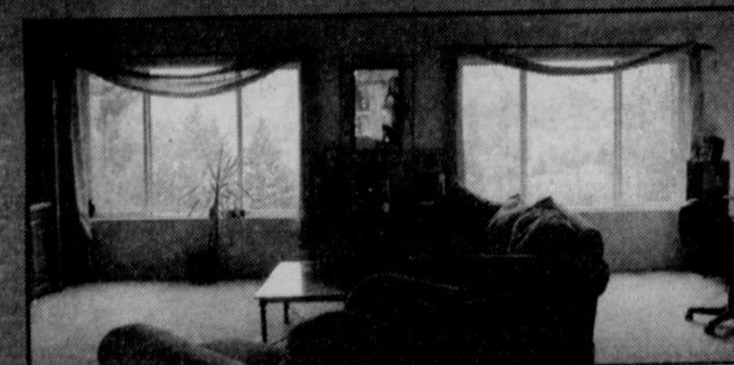
1005 Louisiana Avenue, Vernonia...$134,250

Park-like setting w/over 100 feet of Nehalem River frontage in Vernonia. .93 acre lot has 3D/2BA double-wide mf home with gas heat. Includes 32x24 shop, 8x20 tool shed, covered patio, gas barbecue, RV parking and in-ground sprinkler system!