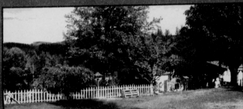
56290 McDonald Road, Vernonia...$274,000

A river runs through it! Beautiful home nestled along Rock Creek on .98 acre. 24x24 shop, 10x20 front deck & 10x16 back deck to watch deer & other wildlife at play. All appliances included. Check out this "fisherman's fantasy" in the country!