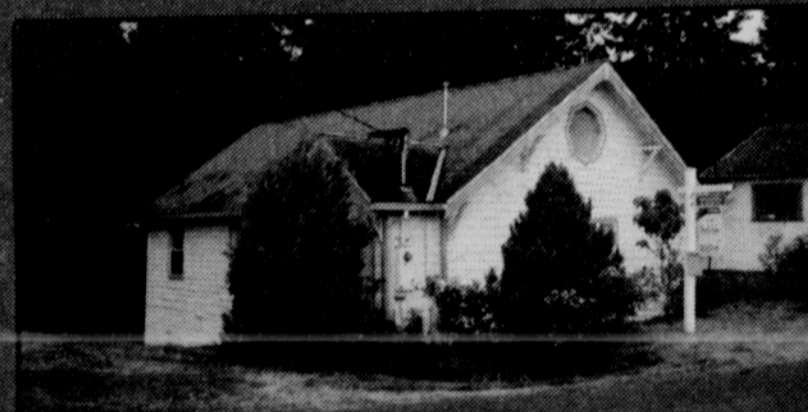
1275 W. Bridge Street, Vernonia...$159,950

3BD/1.5BA bungalow remodel in 2001. New kitchen w/maple cabinets, dishwasher, wainscoting, desk, new floor, dining nook. Lovely living area w/woodstove & cedar wall accents. Finished basement w/2BD & bath. Second buildable lot included in this fenced parcel. Pool, toolsheds, fruit trees & more! Don't judge this book by its cover! It is cute!