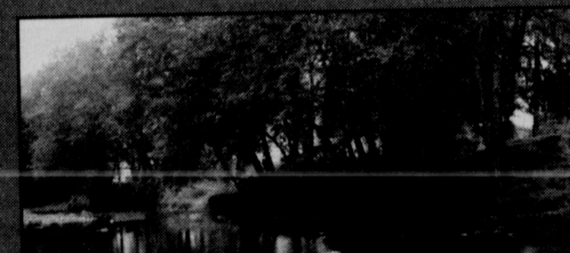
2011 N. Mist Drive, Vernonia...$134,500

Immaculate 3BD/2BA mf home on low maintenance parcel w/room for carport or garage. Home features skylight in kitchen, storm door, open floor plan, covered lanai, large bedrooms including master suite. Seller will carry back second mortgage for 5% of sales price! Low property tax makes this more affordable than most rents! Great location!