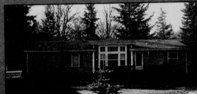
11827 Keasey Road, Vernonia...$166,320

A river runs through it! Beautiful home nestled along Rock Creek on .98 acre. 24x24 shop, 10x20 front deck & 10x16 back deck to watch deer & other wildlife at play. All appliances included. Check out this "fisherman's fantasy" in the country!