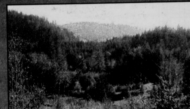
58001 Pebble Creek Road, Vernonia...$259,950

Breathtaking view of City and valley from beautiful 3BD, 2BA home on 6 city lots! Must see interior to appreciate all this home has to offer! A few of the extras are a country kitchen w/island & eat area, master suite w/garden tub & skylight, walk-in closet, lg utility w/work desk and MORE!