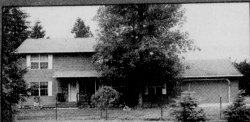
1367 Knott Street, Vernonia...$234,500

EXCEPTIONAL EXECUTIVE HOME IN THE COUNTRY! Immaculate 4BD/2.1BA home on private .76 acre parcel with quiet, serene pastoral views! Model home quality throughout! Home features hardwood floors, gas fireplace in formal living room, relaxing great room off kitchen, kitchen nook, extensive use of tile, formal dining room, office, oversized master suite, attached oversized two-car garage! Close to Intel and Sunset Corridor. Seller will pay $5,000 toward buyer's closing costs with full price offer.