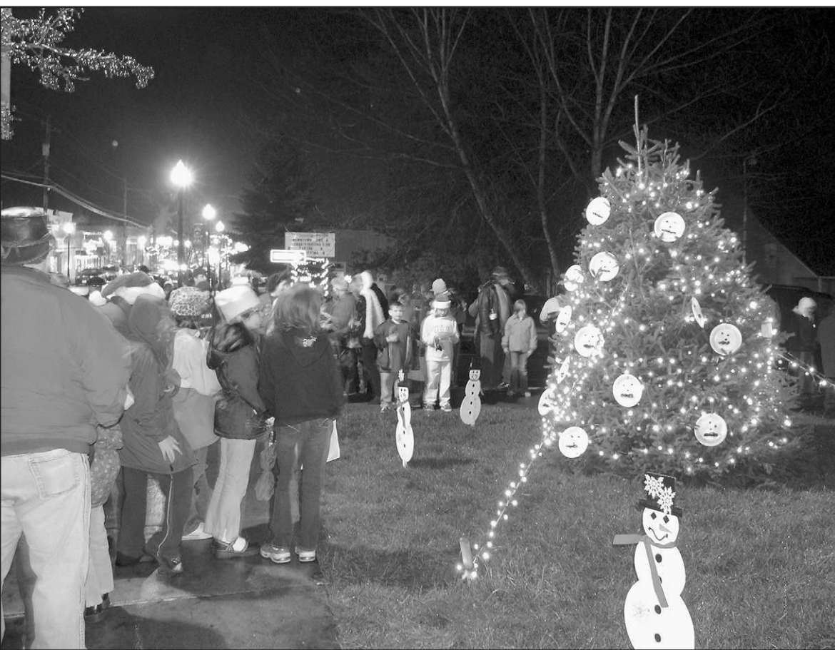
The decorations on Vernonia's community Christmas tree were made by local children.