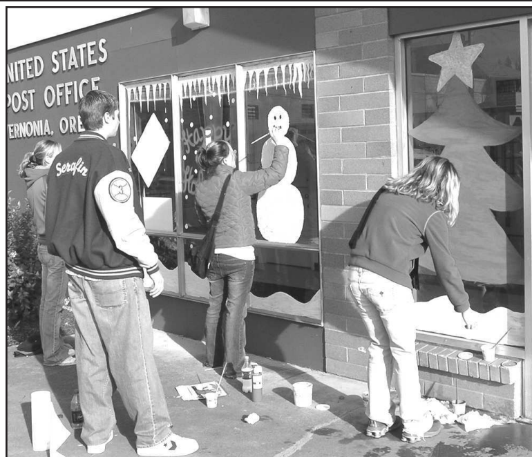
The Vernonia High School art class undertook the painting of windows as a project. Here they are shown while decorating the Vernonia Post Office.