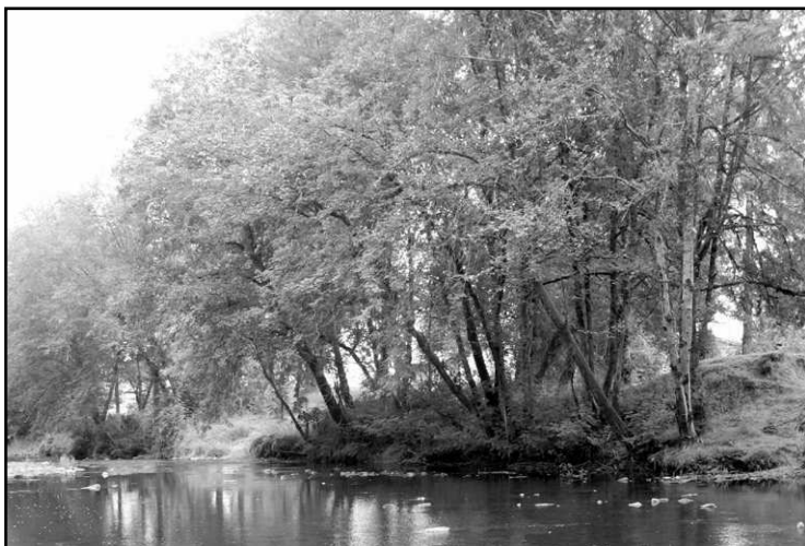
2011 N. Mist Drive, Vernonia

Enjoy the Park-like setting with over 100 feet of Nehalem River frontage from this unique parcel in Vernonia! Magnificent river property on .93 acre includes 3BD/2BA double-wide manufactured home, 32x24 shop and 8x20 tool shed, covered patio, gas barbeque, RV parking and inground sprinkler system! Gas heat. Offered at the incredibly low price of $134,500! Call for private showing today!