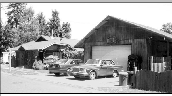
1008 Weed Avenue, Vernonia...$167,500

JUST LISTED! Incredible Value! Best priced 4BD/2BA, 2003 MF home situated on 81x100 oversized lot with over 1900 sq.ft. of living space. Features lg kitchen w/island, vaulted ceilings, family & bonus rooms, garden tub, valley view, open floor plan and all for $68.83/sq.ft. making this A VERY BEST BUY!