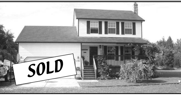
1191 Heather Lane, Vernonia...$149,995

Live peacefully in this executive 4BD/3BA, immaculate residence! Model home quality throughout! Traditional two-story home set amidst rural beauty on .76 acre offers hardwood floors, formal living & family rooms, spacious master suite, oversized laundry room, kitchen w/eat area & gas appliances, private office/den and oversized double garage. Room for everyone and everything!