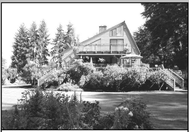
600 Adams Avenue, Vernonia...$399,999

Gorgeous .42 acre parcel in prestigious Heather Park! 3BD/ 2.5BA, 1995 home is situated in a very private cul-de-sac w/ample parking for your recreational vehicles! Many fine amenites include attached 2-car garage, gas heat, cozy wood fireplace and easy-flowing floor plan. This property offers outdoor living at its best with garden area and fruit trees, inc. raspberries! Exceptional property!