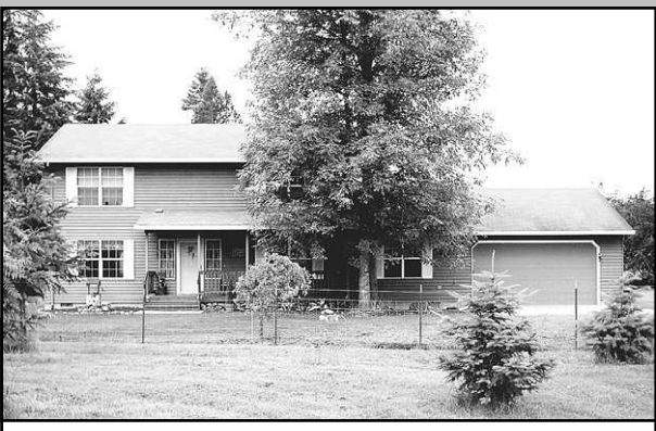
1367 Knott Street, Vernonia...$234,500

Park-like setting w/over 100 ft of Nehalem River frontage has 3BD/2BA double-wide mf home, detached 32x24 shop, 8x20 tool shed, covered patio, gas barbeque, RV parking and in-ground sprinkler system! Gas heat. Home is in very good condition and is easy to show. All on unique .93 acre parcel with all city services. Cash terms. Incredibly low price! Call for private showing today!