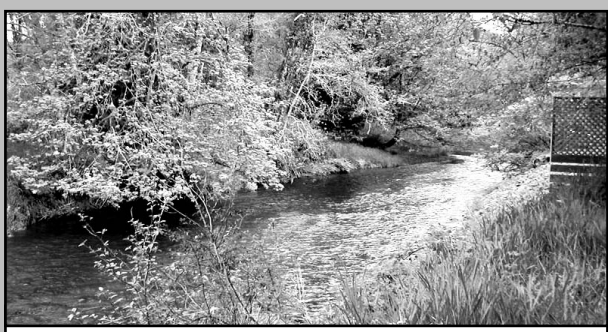
Creekview Lane, Vernonia...$49,950

Rock Creek frontage! Perfect for your new home or MFH approx. 5 miles out Keasey Road in the country! One-third acre well-priced parcel has septic approval, water hookup, power availability, elevation certificate, privacy and pastoral views! Fish from your deck, watch Bambi grow, and delight in nature's wonders!