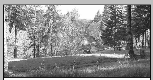
Scappoose-Vernonia Hwy., Vernonia...$130,000

Very Unique 3BD/2BA, 1684 sq. ft. home on .22 acre parcel w/2-story shop! Must see inside to appreciate all this home has to offer! Lovely hardwoods & tile features, spacious kitchen w/eating area, family room & Ig bathrooms! Private lanai off family room for outdoor entertaining, dog run, and spacious garden! Walking distance to downtown.