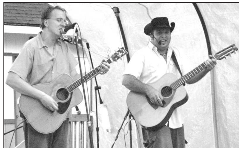
Below, Quality Name Brand Band performed on the Alternative Stage on Saturday, August 7. The Alternative Stage is a free three-day music festival held during Jamboree.