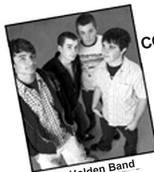
The Holden Band