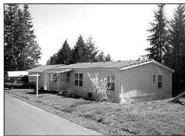
GREAT PRICE! 3BR/2BA manu home on .3AC. Sec. system, RV space, 2-car garage. Roseview Heights....$112,500