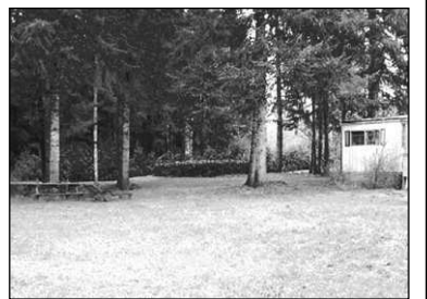
2.5 AC NEAR GOLF COURSE, Nehalem River & airstrip. Fruit trees, older 2BR mobile, fenced garden..$174,500

OPEN 7 DAYS A WEEK TO SERVE YOUR REAL ESTATE NEEDS