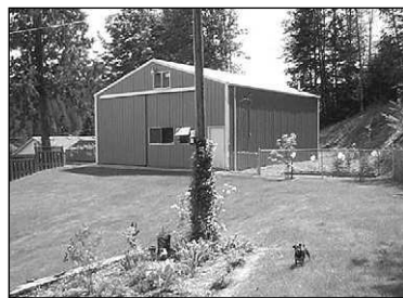
5 CITY LOTS 4BD/2BA home w/great bonus rm, 2 shops, RV garage, dog run. AMENITIES GALORE!..$269,500