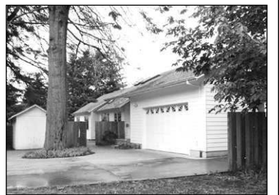
FISH & RELAX on nearly 1AC of Nehalem Riv. front. 3BR/2BA home, unf bsmt, gas heat, cov. patio.....$144,900