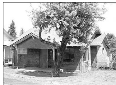
REMODELED 3BD home w/view over Vernonia. 100x100 fenced lot, partial bsmt, new roof. Easy to show...$97,500