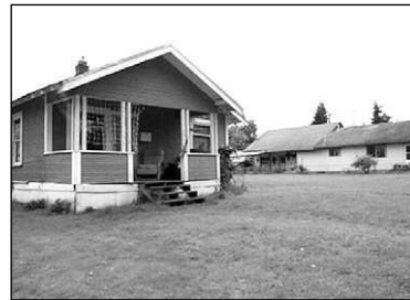
NEARLY ORIGINAL MILL HOUSE w/2 lots. Build on one, rent the other. Near lake and Fire station.....$69,900