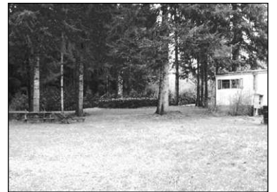
2.5 AC near golf course & airstrip. Treed, fruit trees, garden area, fenced. Live in 2 BR singlewide while building...$174,500

OPEN 7 DAYS A WEEK TO SERVE YOUR REAL ESTATE NEEDS