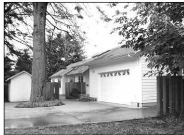
FISH, RELAX on near 1AC Nehalem Rvr front. 3 BR, 1 BA, unf. basement, nat. gas, dbl gar, cov. deck...$144,900