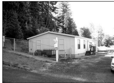
WHAT A BUY! 2 BR, 2 BA mf home. 24x24 shop, conc. floor, 220 elec, 12x24 loft. Owner carry w/lg down...$107,900