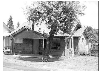
100X100 LOT with remodeled 2 BR home w/partial basement, new roof, lg fenced yard. Vernonia view....$97,500