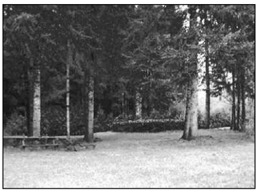
BEAUTIFUL BUILDING SITE Parklike setting w/2.62 acres and large firs, pines and fruit trees.....$174,500