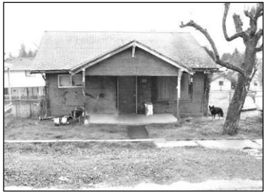
this 3BD home w/views of Vernonia. room, large lot. Partly finished base-Extra lot avail. for $21,000 ....$79,000 ment. Storage galore!.....$152,000