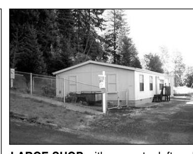
LARGE SHOP with concrete, loft and 220 elec. Fully fenced, spotless movein ready home......$107,900