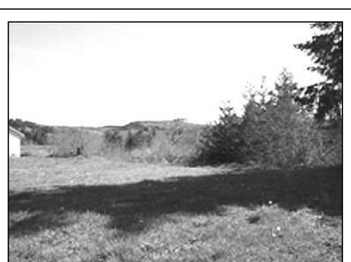
LAKEVIEW LOT Excellent building site w/views. Builder will pay City fees......$44,000