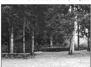
BUILD YOUR DREAM HOME on this pristine 2.62 AC. Underground water system thru-out property......$174,500