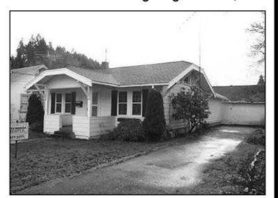
CUTE COTTAGE in nice neighborhood. 2+BD home, large detached garage. Lots of attic storage...$75,000