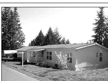
VERY WELL-KEPT HOME on over 1/4 acre. Nice private deck, trees & wildlife. 2 car o'sze garage...$112,500

MANY MORE GREAT PROPERTIES TO MEEET YOUR NEEDS