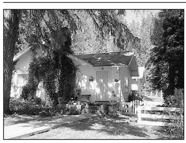
ROOM FOR EVERYONE 4BD, 2BA home. Fireplace in huge lvg room, fam room in finished basement...$152,000