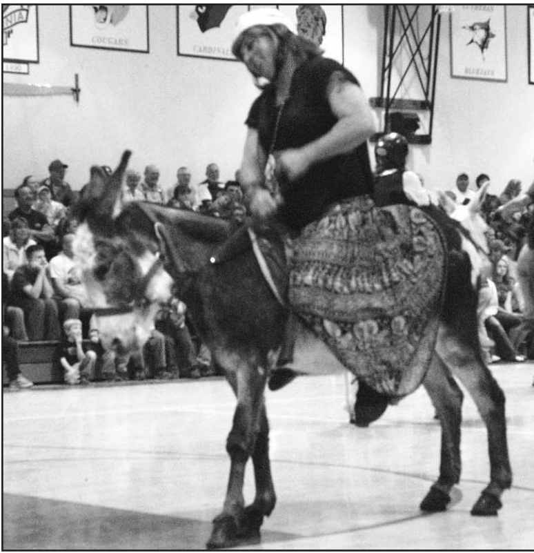
Donkey Basketball on April 2 was great fun for spectators, but riders appeared to experience some frustration trying to get the donkeys to cooperate. Clockwise from right, Community team member tries to reach ball without letting go of donkey; "firewomen" member tries to reach ball; Community member shoots; "firewoman" talks to donkey. Four teams participated; Community, Equestrian Team, School Staff, and "Firewomen." Community was the overall winner.