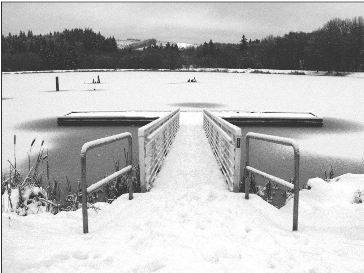
Last week, Vernonia Lake was looking very cold and ready for some serious ice-fishing. There was evidence that someone had walked on the lake around some of the edges.