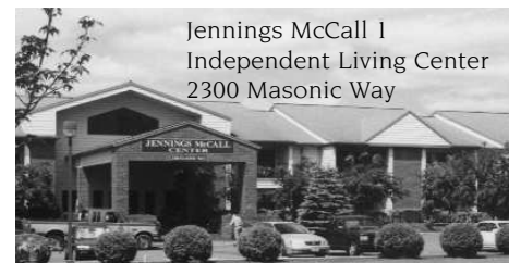
Jennings McCall I Independent Living Center 2300 Masonic Way

Enduring, Compassionate Care Since 1922. Provided and Operated by the Masons