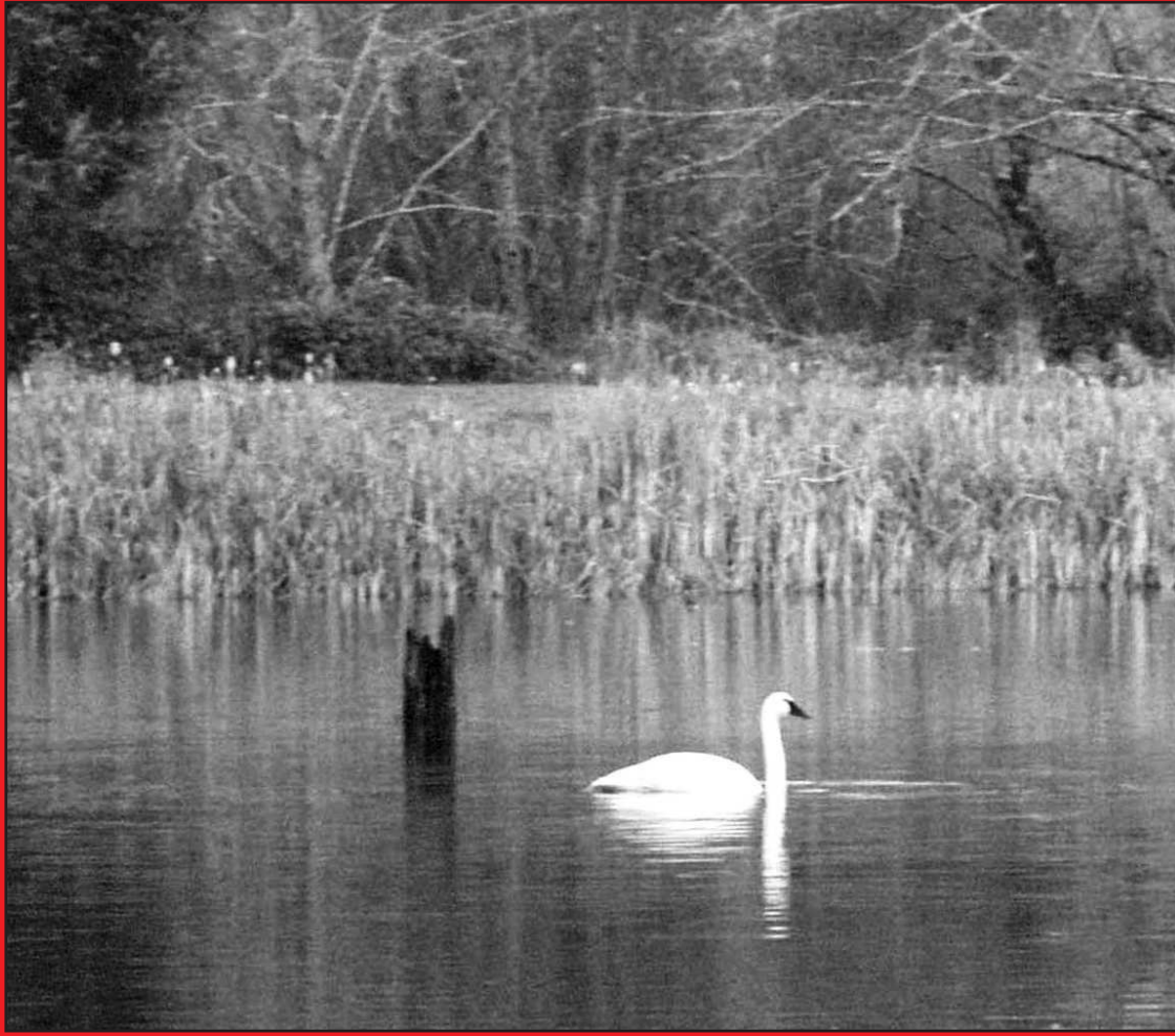
An addition to the wildlife at Vernonia Lake is this graceful swan, which has been feeding on the lake for about four weeks. It has been joined, occasionally, by a few other swans, but they were only passing through. Bald eagles have also been feeding at the lake.