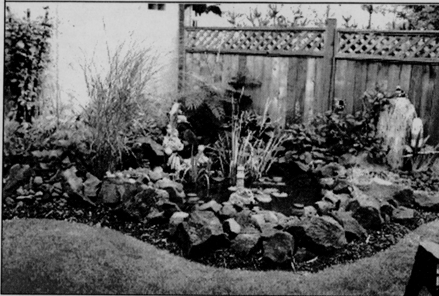
This is just one small detail of the many fine features in Cindy Woodall's yard