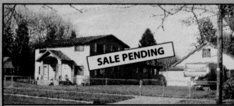
294 "B" Street, Vernonia...$168,900

SIMPLY MUST SEE all this property has to offer! Great shop w/attic, beaut fenced yard, inlaid tile on hdwd flrs, oversize bedrooms, den, ofc, lovely remodeled baths, wonderful country kitchen, very large lot, cedar siding and privacy!