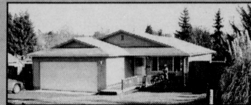
866 1st Avenue, Vernonia...$130,000

Beautiful, immaculate upgraded hm in walking distance to shopping/schools! Attention to detail is apparent in this 3BR/2.5 BA two-story hm. Lg. kit. & bdrms. Partially fenced yard. Oversized garage. Spa hookup. Very good buy!