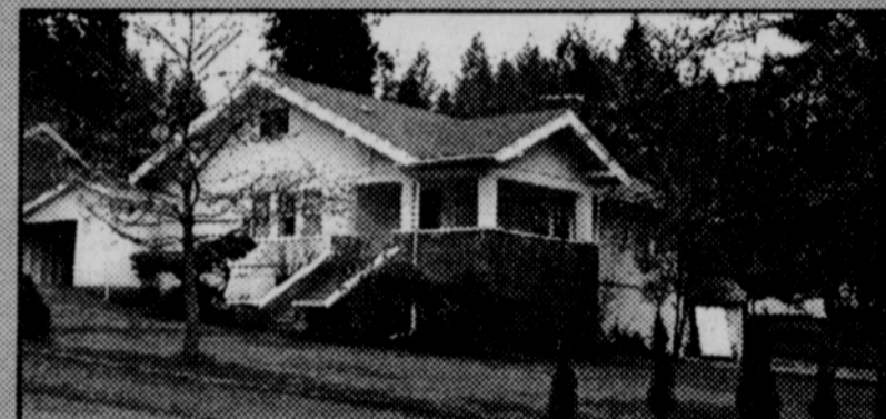
496 E. Arkansas, Vernonia...$199,950

Contemporary charmer best describes this awesome two-story, 4 BR, 2 BA country home! Great location, fenced yard, 30x30 det. 2 story shop, family room, large country kitchen and newer roof, furnace & plumbing! Swimming pool w/large deck for those hot summer days! Room for the RV & garden. too. De-