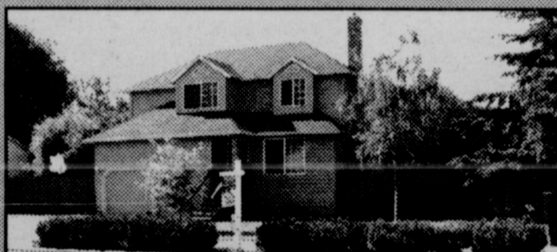
1211 Heather Lane, Vernonia...$149,950

What a charmer! Affordable, energy efficient 2BD/1BA 1100 sq ft bungalow in walking distance to Birkenfeld store! Appliances incl! Move in ready! Propane heat! Low property taxes! Det. shop & lg enclosed porch. Call for more info!