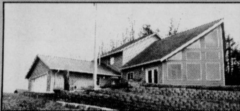
1278 Louisiana Avenue, Vernonia...$375,000

HOME OFC: 503 429-7013 CELL: 503 816-4249 E-MAIL: SNANCY102@AOL.COM