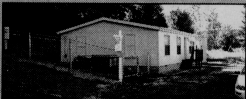
101 North Street, Vernonia...$125,000

Premiere, rare 7.61 AC on Scppoose-Vernonia Hwy approx. 4 mi north of Vernonia! Has conditional use permit! Beautiful view of Nehalem River from home site! Road cut into property. Some merchantable timber. Ready for your dream home!