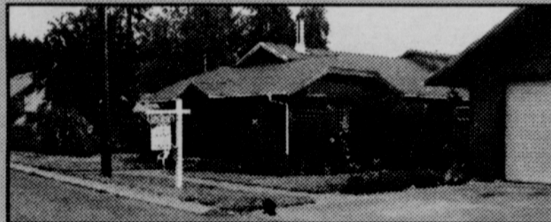
1008 Weed Avenue, Vernonia...$167,500

Immaculate, upgraded 3BD/1BA starter home complete w/new fence, lg 2-car garage, open floor plan, wonderful kitchen, children's playhouse & new decks to view the sunsets!