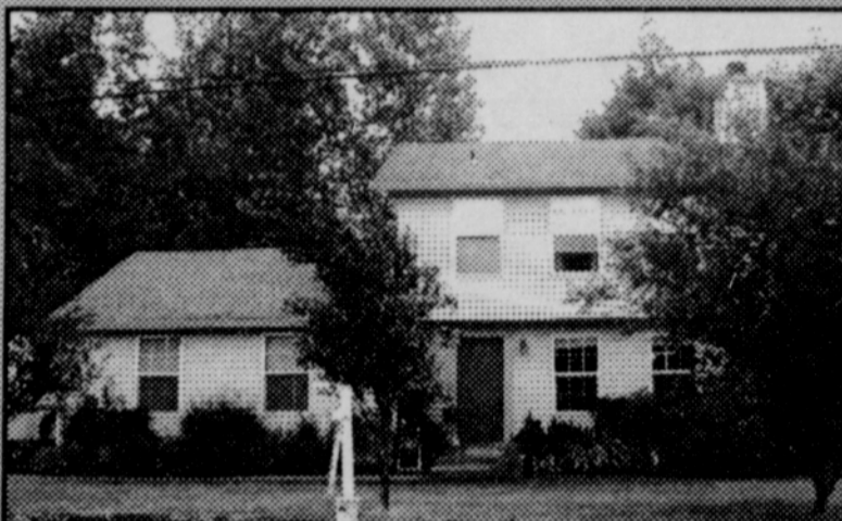
275 "E" Street, Vernonia...$142,500

Extraordinary custom home with breath-taking views of Coast Range and City. Extensive use of granite & marble throughout 3BD/2BA executive home! Two shops for the yacht & hobbies! Gourmet kitchen w/floor to vaulted-ceiling windows captures the essence of country living! This is the home for those who won't abide the ordinary!