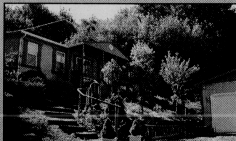
1486 Alder Street, Vernonia...$155,000

Great buy! Immaculate, upgraded 3BD/2.5BA home situated on 1/3 fenced acre! Tiled kitchen & dining rooms, covered patio, beautifully landscaped with plenty of room for the RV & more! Make an appoint to see today!