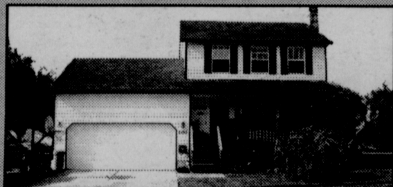
1191 Heather Lane, Vernonia...$153,900

PRIVACY! Wonderful .59 acre parcel high on hill with view! Lovely 3BD/2BA mf home w/det. oversized garage/shop and tool shed! Office/bonus room or 4th bedroom! Lovely color scheme throughout. Low maintenance yard offers endless possibilities. Skylights brighten the open kitchen w/vaulted ceilings in living area. Gas fireplace in family room. A Must See!