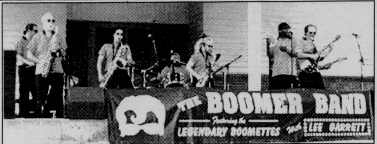
The Boomer Band once again entertained and delighted throngs at Jamboree Cruisin' 2003