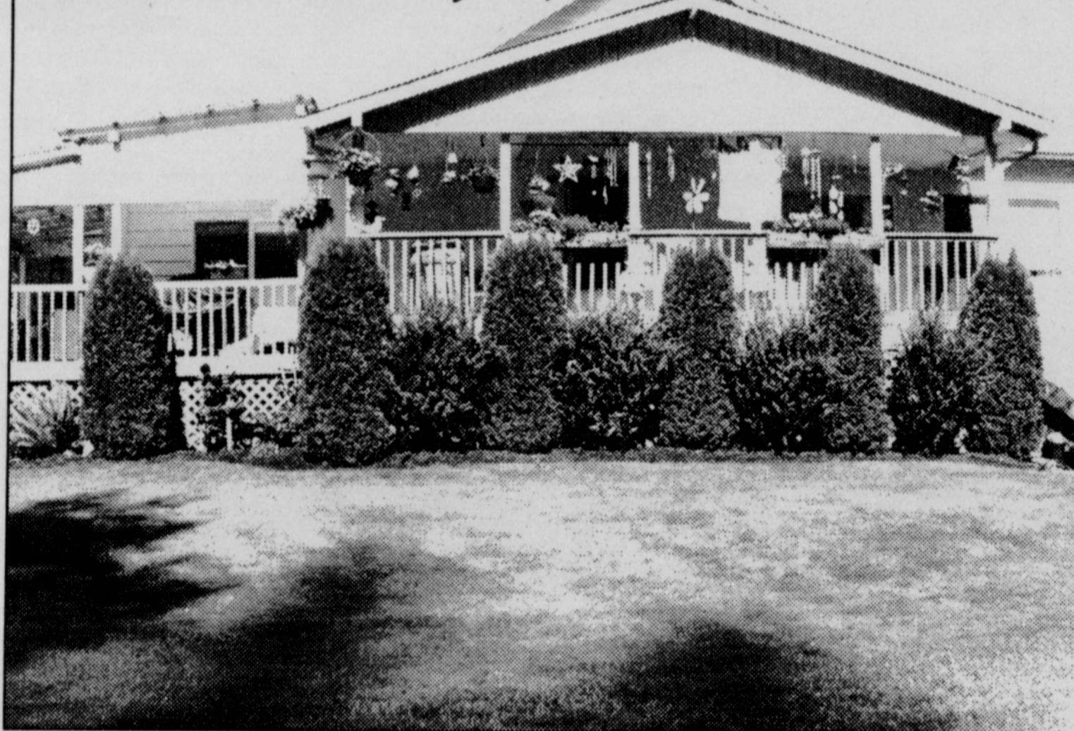
The Shafer residence at 57394 Lone Pine Road was selected for Yard of the Month honors for June. Beautiful landscaping surrounds the house, and is worth a short drive to enjoy. Nominations for Yard of the Month may be put in a box in the Vernonia City Hall lobby.