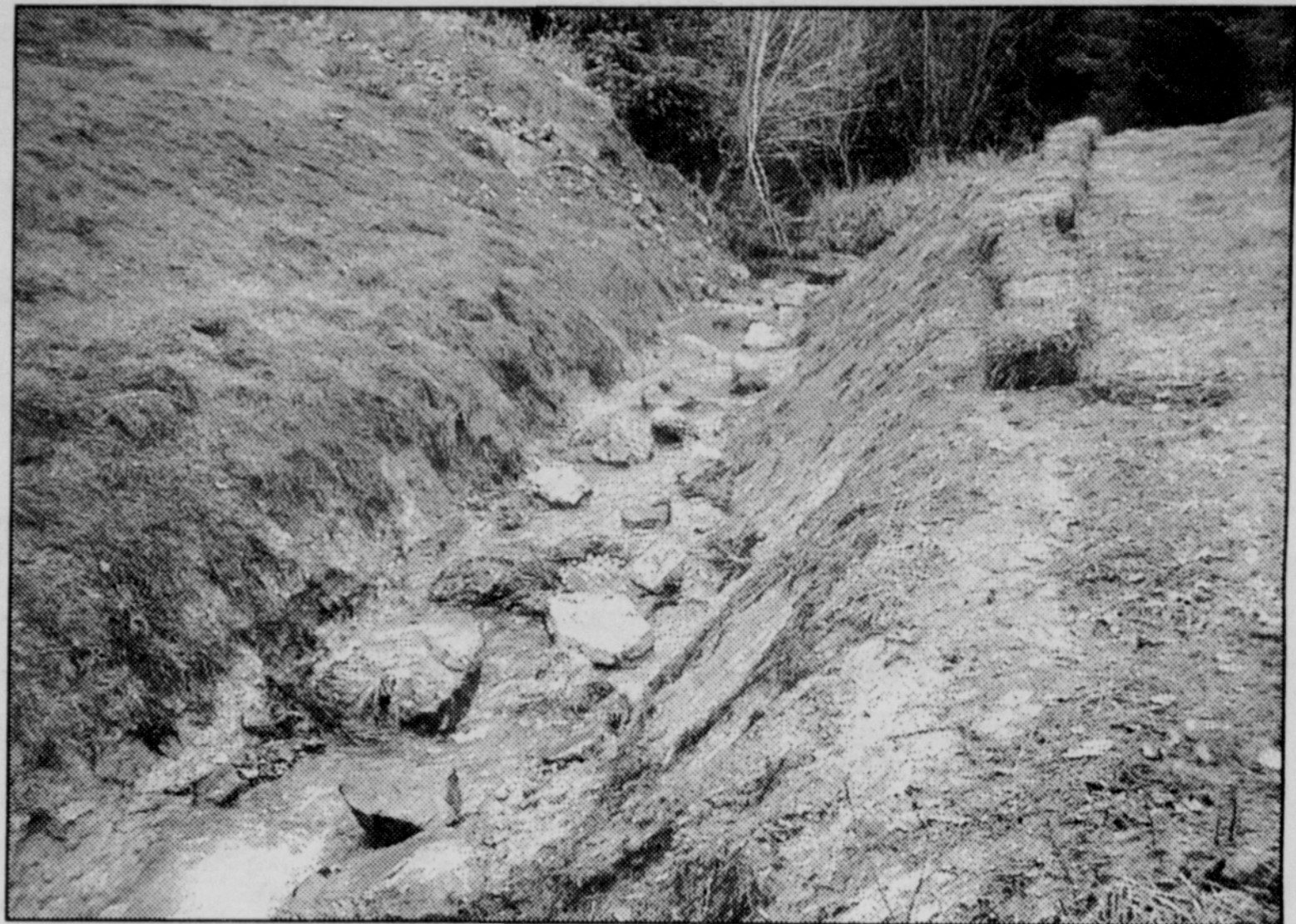
After a road and culvert were removed, Sanders Creek didn't look like much, but it took only a few months for endangered coastal Coho salmon to start making it home again.

From page 12 precious to the ecosystem and economy of the Pacific Northwest.