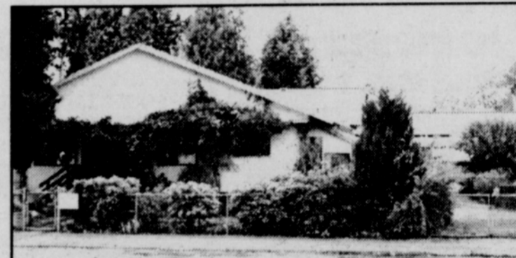
332 A Street, Vernonia...$150,000

BEST PRICE! 1998 double-wide 3BD/2BA 1300 sf mf home within walking distance to shopping, parks and swimming! Very clean and move-in ready! Small storage shed and manageable yard! Great starter!