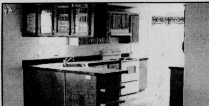
874 Jefferson Avenue, Vernonia...$99,950

You are going to love this home! Bright, open & immaculate w/personality! Tile throughout this cute completely remodeled bungalow! View lot. Great 1st time home or retirement home! Ready for you! Make An Offer!