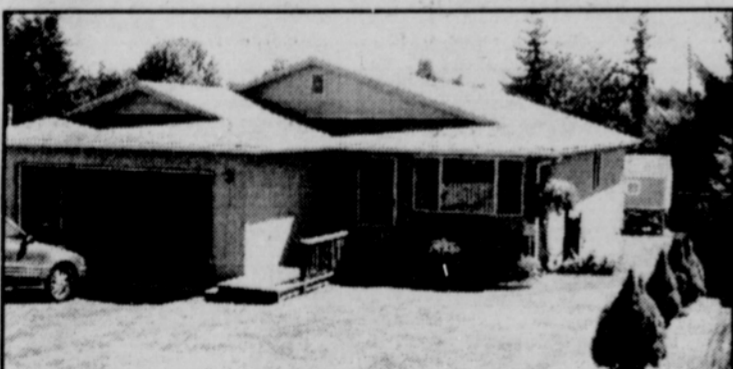
866 1st Avenue, Vernonia...$129,950

RARE FIND! 4BD/2BA 2600sf hm on 2 tax parcels - 2nd home possible! RV parking, firepit, 2 ponds, outbuildings and 3 water sources (incl City water), yet in the country. Call for brochure.