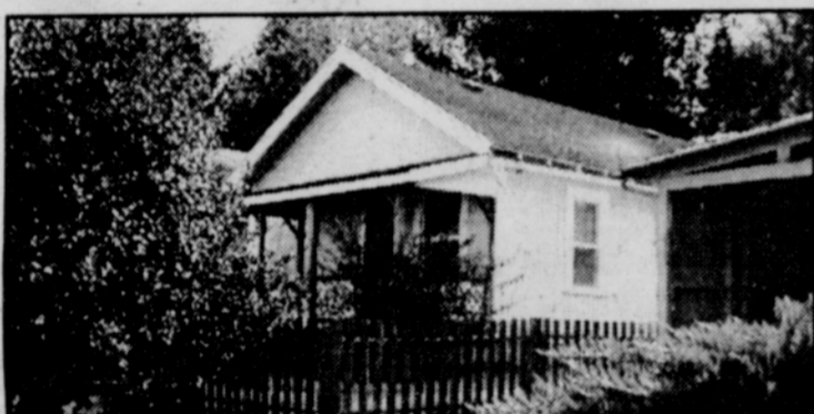
441 1st Avenue, Vernonia...$89,950

Over 3,000sf, 3BD/3BA estate situated along Rock Creek in Vernonia. 1.56 landscaped acres. Asphalt driveway, extensive decking, shops, garage, vaulted ceilings & more!! Brochure available, see by appt. only.