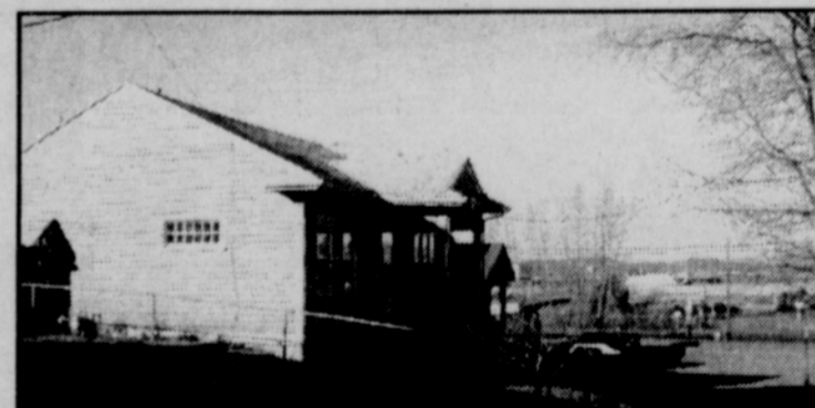
214 6th Street West, Rainier...$79,900

Beautiful 3BD/2BA mini-estate w/45x80 pond, 2 horse stalls, corral, 576+sf deck, 6-seat Cal Spa, 40x60 shop w/220 wiring, gas f/p & more!! On 1.41AC in prestigious Heather Park!