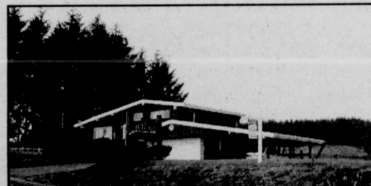
18209 Keasey Road, Vernonia...$450,000