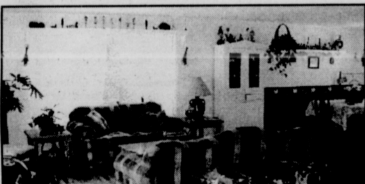
17895 Noakes Road, Vernonia...$158,950

ABSOLUTELY BEST BUY! 1476sf, 2BD/2BA home on corner lot! Nice floor plan, lg family room, upgraded oak cab, gas f/p. GREAT 2300sf SHOP, greenhouse, fruit trees, fenced yard, PLUS 2nd hm w/potential $450/mo rental.