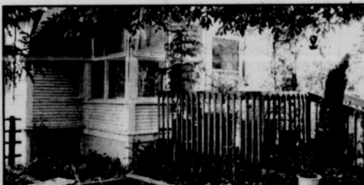
1020 Mist Drive, Vernonia...$119,900

Views to brag about from deck of 4-5BD/2BA two story home high above city! Enjoy koi pond on one of three lots! Lots of extras incl. 4-bay SHOP, gas & wood heat, family rm. Hardwood floors! BEST PRICED SLEEPER!