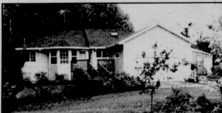
1363 Heather Lane, Vernonia...$274,500

Just Listed! Immaculate, upgraded 3BD/1BA starter home complete w/new fence, lg 2-car garage, open floor plan, wonderful kitchen, children's playhouse & new decks to view the sunsets!