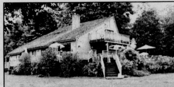
600 Adams Avenue, Vernonia...$375,000

Lovely, secluded & immaculate w/view! 3BD/2BA mf hm on nice 100x100 lot high above city! Custom swing set stays! Lots of extras in this vaulted ceiling hm. Special 100% financing available!