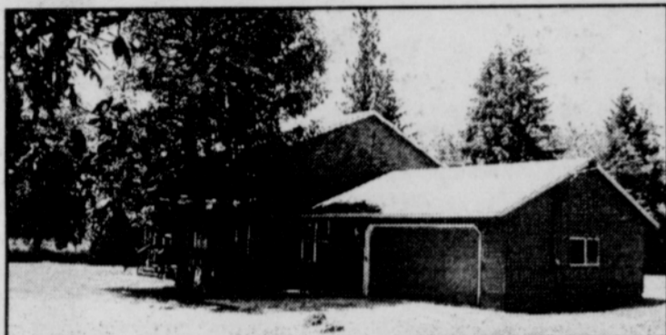
1367 Knott Street, Vernonia...$199,987

Beautiful 2500+sq. ft. 4BD/3BA exec hm, 2 car att garage. Hardwood floors, gas f/p, upgraded tile, carpet, ofc/den, fam room, o'sized rooms and cov. deck on .70 acre! Adjacent lot incl. w/full-price offer.