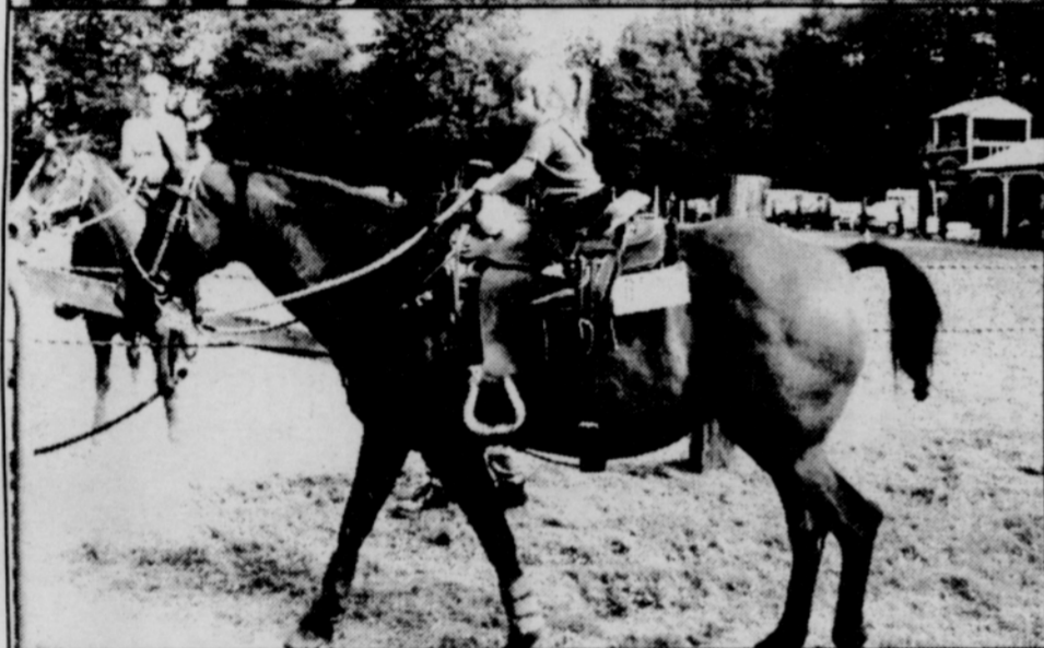
Above: Participants and spectators gather for horse gaming in 2001.