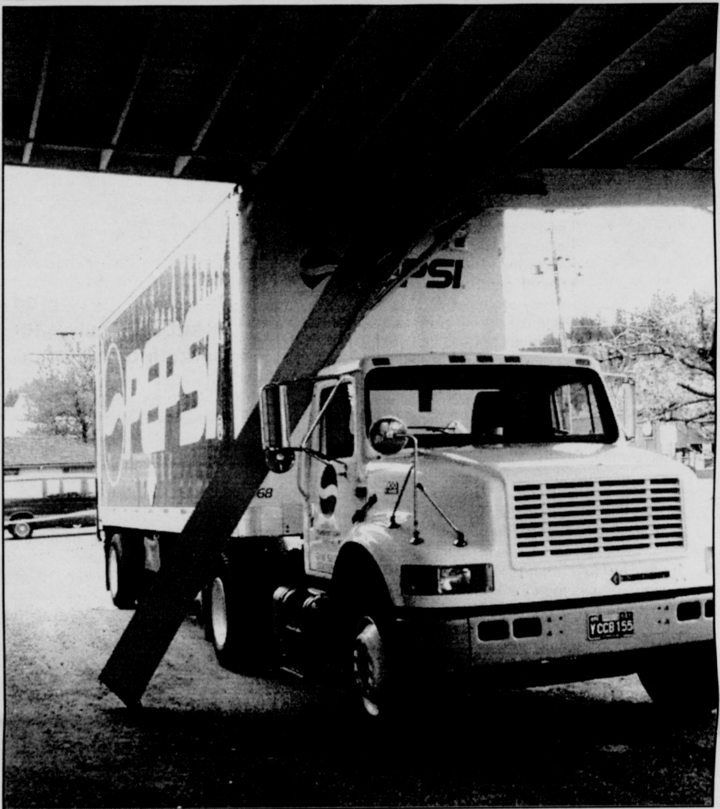
It was no contest when this Pepsi truck met a 50 year old canopy on the east side of Vernonia High School. The driver was new to the route and apparently was unaware that there was any other way to get to the parking lot.

Vernonia Pride will have donation cans throughout town for the fireworks; your help is needed.