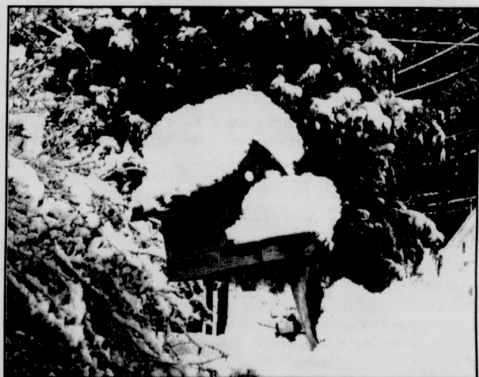
A mid-March snowfall made this bird house inhospitable.

Three months later, the owl was healthy enough to return to the wild, so Rand brought it back to Vernonia and released it near where it had been found. After checking out the situation for a few minutes, the owl flew into the underbrush, then headed for the trees.