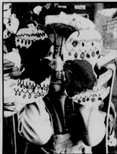
Paint, sparkles & antennae complete the ensemble.

Students in kindergarten through sixth grade at Mist, Lincoln and Washington Grade Schools will experience the art of Mask Making, under the di-