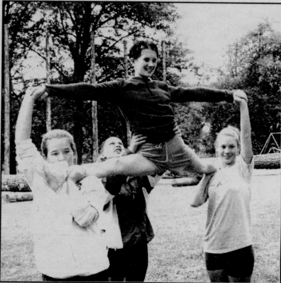
Caught unaware because they didn't know a photographer was going to show up as they practiced in Hawkins Park,

Fundraising activities will continue with a bottle and can drive on Monday after Jamboree. Cheerleaders are also responsible for picking up garbage cans a couple of times over Jamboree weekend.