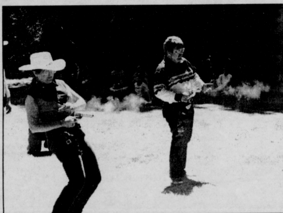
Speed, agility and accuracy are needed by successful contestants in the Fast Draw competition.

In the second competition, contestants use 45 caliber ammunition with a shotgun primer and a bullet made of wax. Shooters compete individually, with targets that are 20 inches wide and 40 inches high, firing from distances of five, eight, 10, 12, and 15 feet.