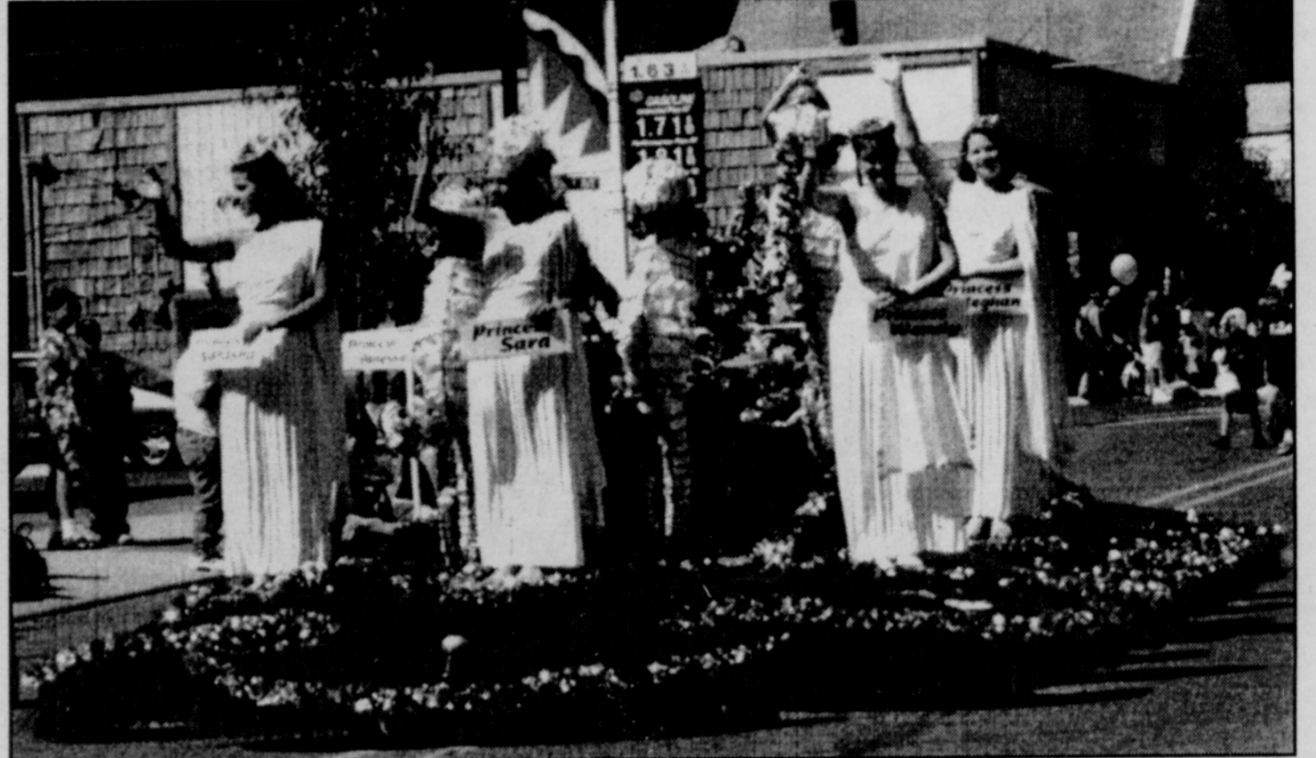
The Astoria Regatta court provided one essential for a parade: Pretty girls on a pretty float.