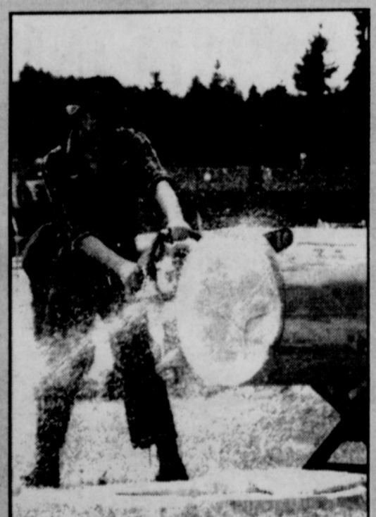
Logging Show Action on Sunday!