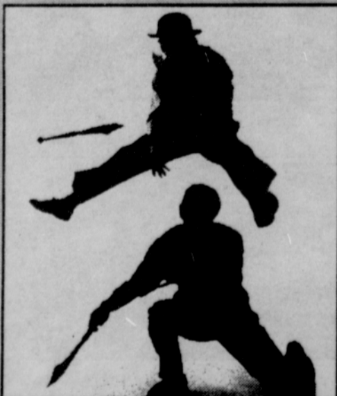
The Gentlemen Jugglers

9:00 AM Gates Open 1:00 PM Baby Contest – Stage 1 7:00 PM Fireballs Square Dance – Stage 2 11:00 PM Gates Close