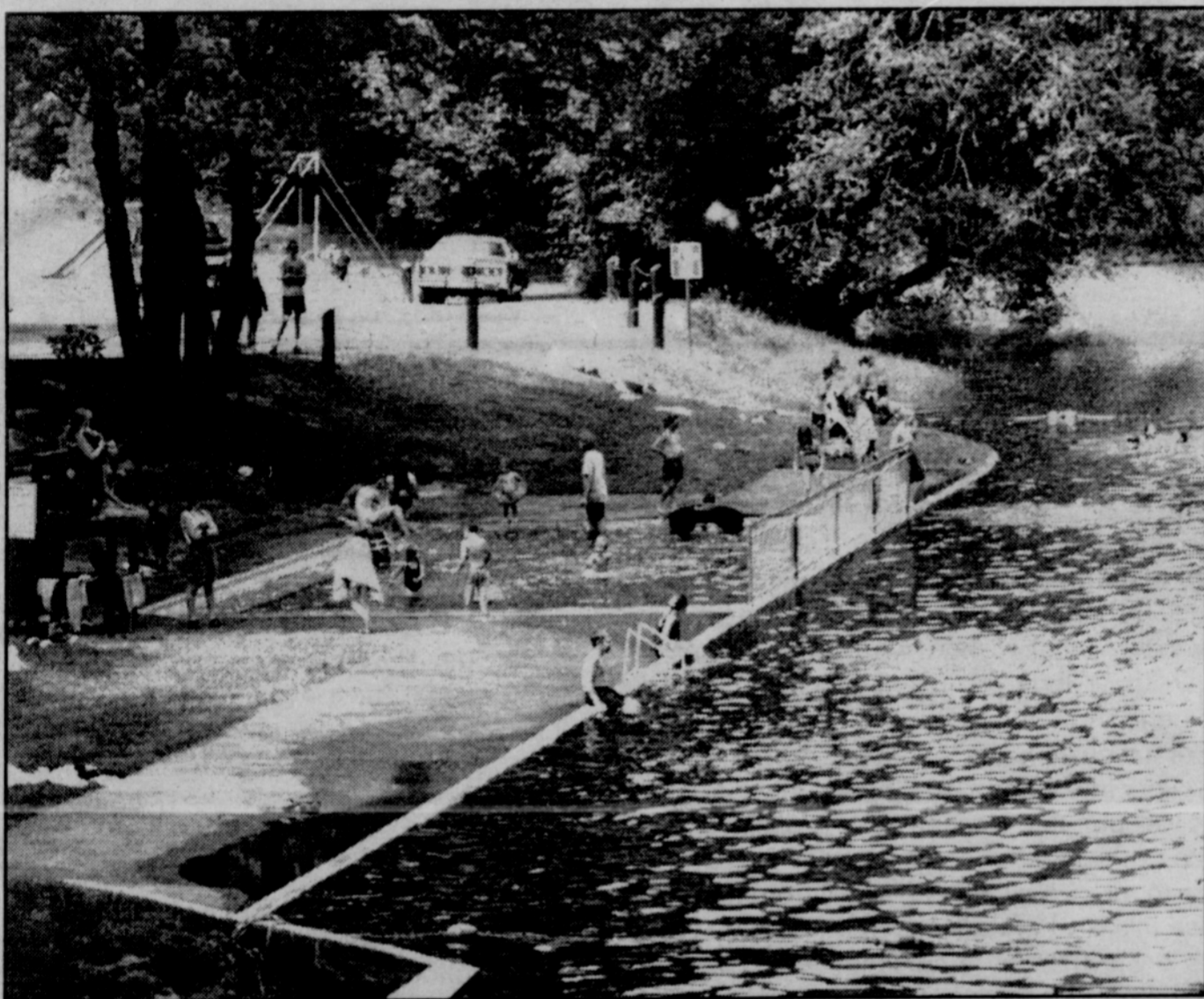
The cooling waters of Vernonia's Rock Creek swimming pool were made even more enticing by a few days of warm weather.