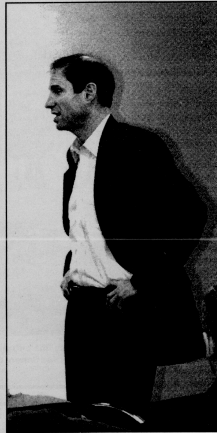
A tieless Senator Ron Wyden answered questions without pause for about two hours at his town hall meeting in Vernonia.

Social Security payments and potential Social Security deficits also attracted questions. Wyden said that the Social Security surplus should be "Off limits" to all other parts of gov-