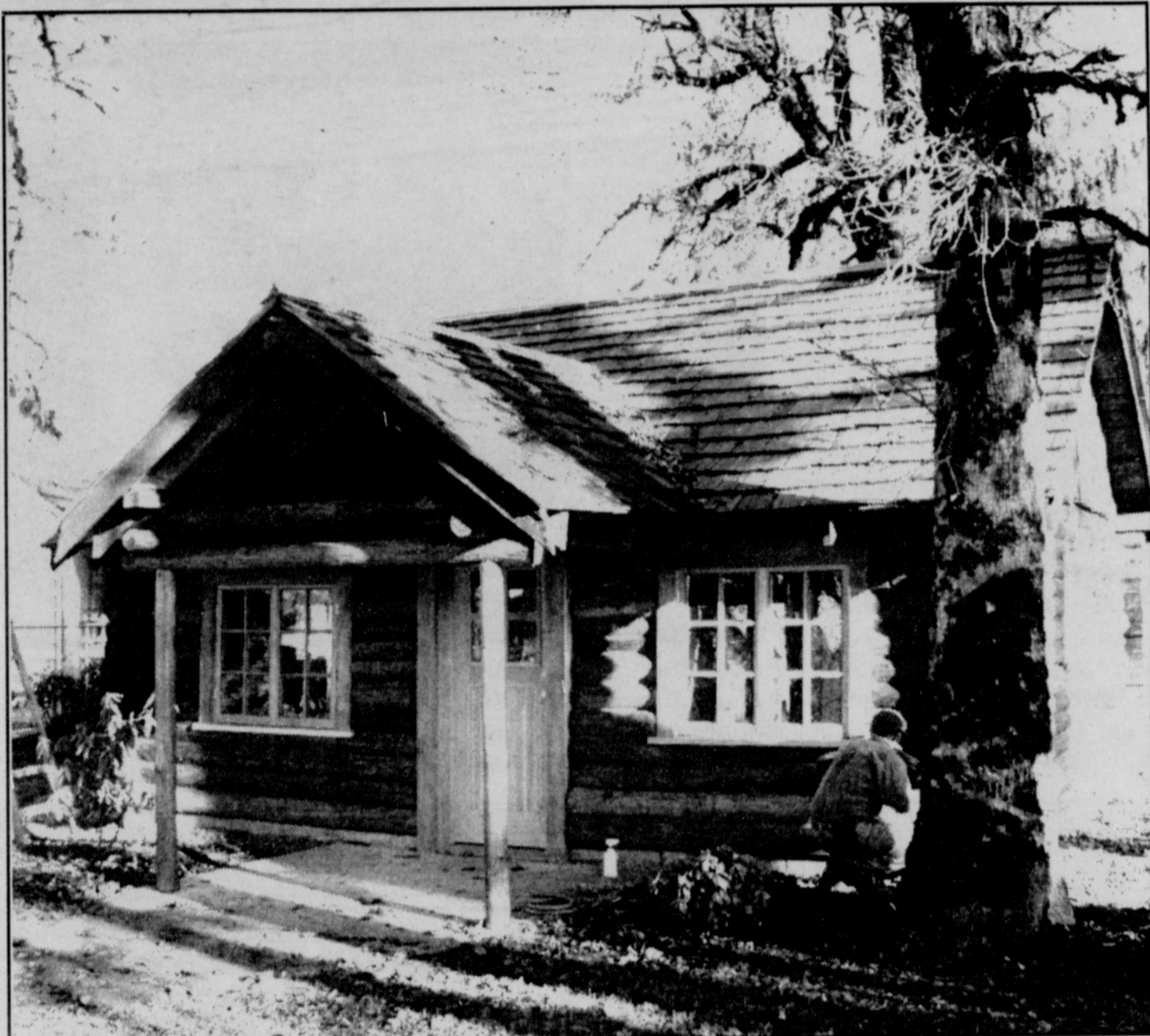
Restoration work on the old log cabin is nearing completion.

Renovation of the historical Scout Cabin is nearing completion in Banks. Fathers of boys in Troop 240, and other local men, built the original Scout Cabin in 1930. Boards used in the log cabin were milled at the Lundeen Sawmill and Duke Brickyard provided bricks.